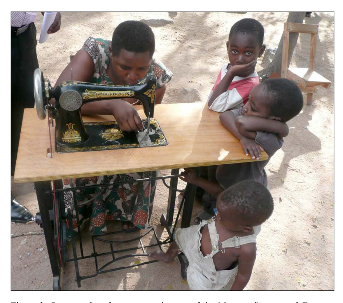
Figure 2: Picture taken during an evaluation of the Mwanza Sewing and Training Centre during April 2011.

"I have been working with SIDO-MSTC since the inception of this project, but compared to so many other projects, we have through this project been able to increase our collaboration and networking with the community and all other actors. As a person, I see this as a success and an achievement to us all" — Co-ordinator, Magu