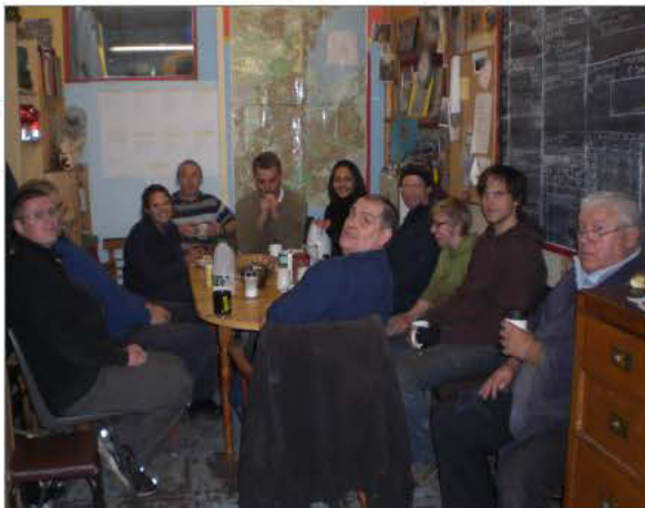
Belfast volunteers enjoying tea. And biscuits. And lollipops.